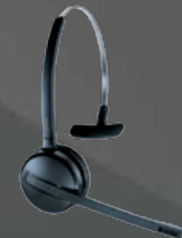
Jabra PRO 9450

Jabra PRO™ 9400 Series headsets' stylish, discreet design is adaptable for different wearing styles that ensure a perfect fit all day long. As Unified Communications becomes the norm, users will be wearing their headsets for longer periods, making comfort more important than ever. Choose between a headband, neckband or try the unique Jabra earhook. All wearing styles allow for easy adjustment for use on the left or right ear.