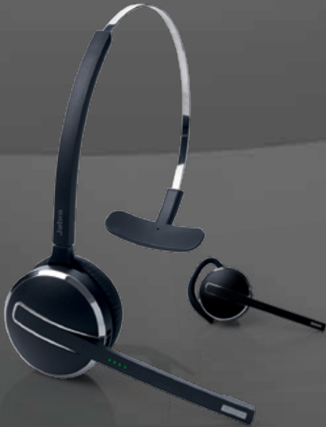
Jabra PRO™ 9470