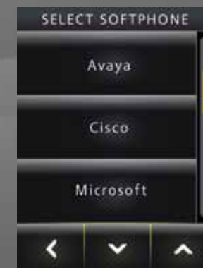
SETTING UP THE HEADSET