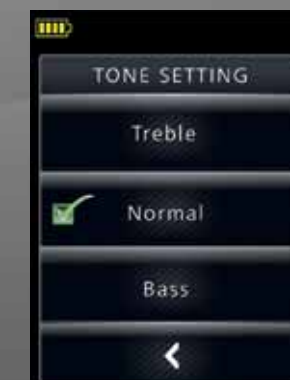
PERSONALIZING THE HEADSET