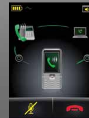
MERGING A CALL