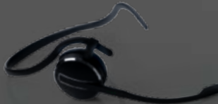
Jabra PRO™ 9460