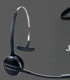
Jabra PRO 9450 Flex/ Jabra PRO 9460 Flex