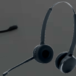
Jabra PRO™ 9450 Duo/ Jabra PRO™ 9465 Duo/ Jabra PRO™ 9460 Duo