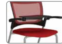
TAB-A14 RIGHT FOLDING TABLET ARM W/ A14 LEFT ARM