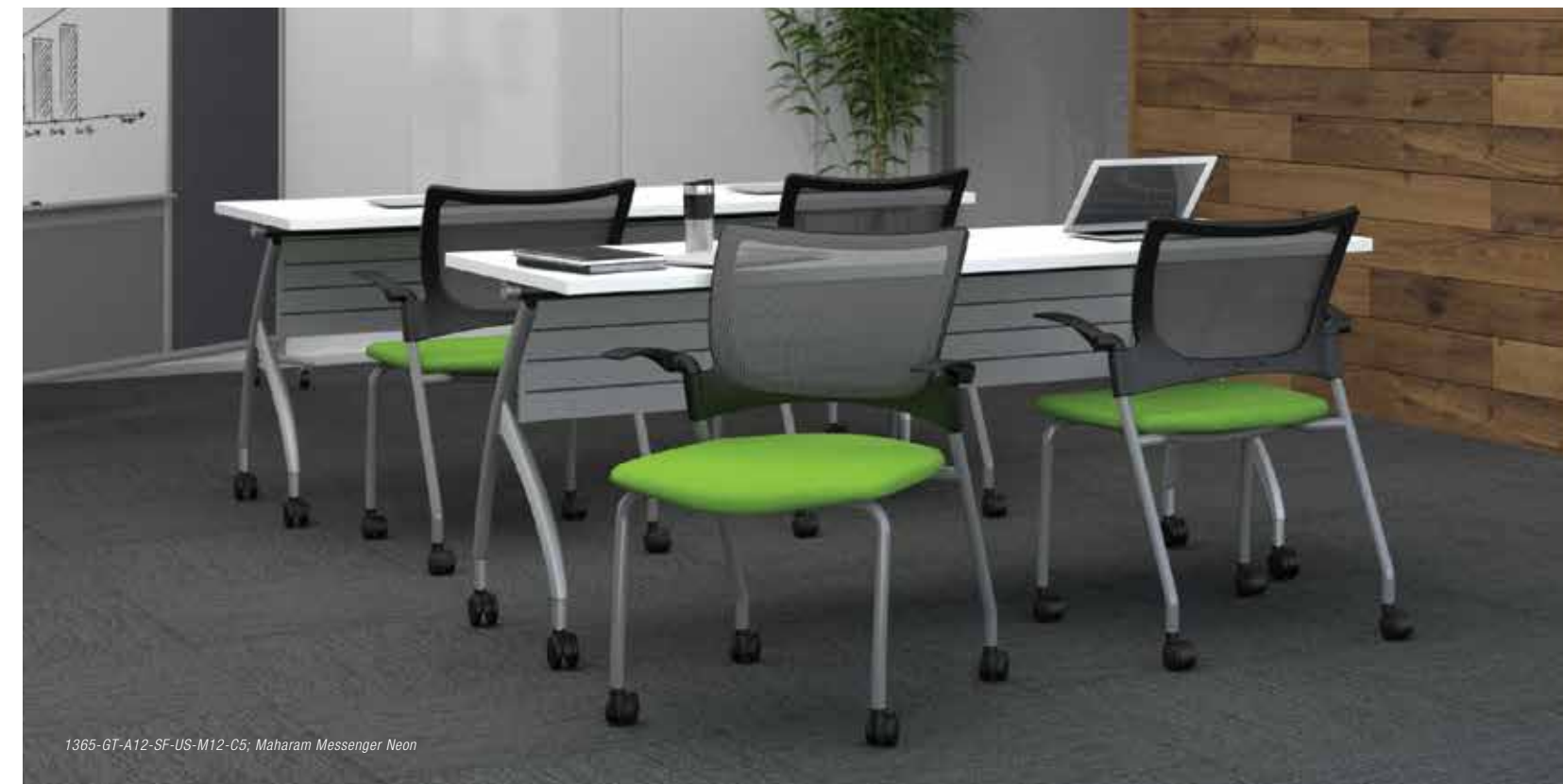
1385-GT-A12-SF-US-M12-C5; Maharam Messenger Neon

Adapt. React. Move. People are on the move, looking for new and innovative ways to get stuff done. As a result, collaborative spaces are in high demand. The Bella multi-purpose series transforms any space into a dynamic environment, capable of supporting the many ways people work. From flexible training areas, to dedicated workstation spaces, to the countless gathering opportunities in between, Bella possesses an impressive collection and design that delivers comfort and flexibility.