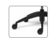
STANDARD BA9B 26" HIGH PROFILE NYLON BASE-BLACK