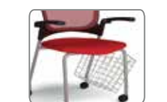
BSK LEFT OR RIGHT SIDE HANGING WIRE BASKET