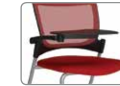
TAB-A00 RIGHT FOLDING TABLET ARM