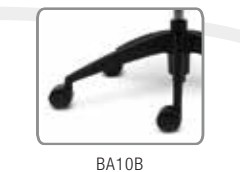
BA10B 26" HIGH PROFILE ALUMINUM BASE BLACK POWDER COAT