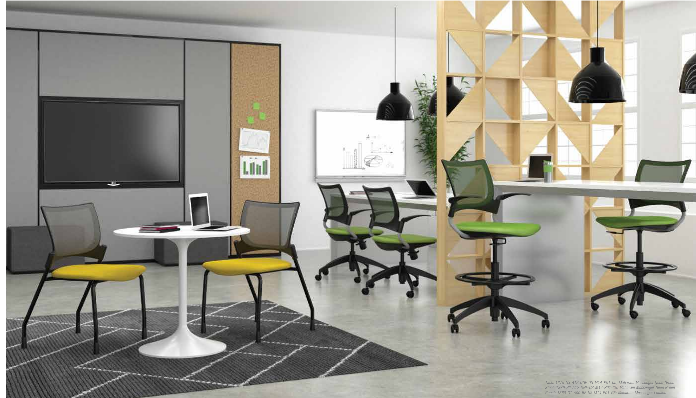
Task: 1375-S3-A12-DGF-US-M14-P01-C5; Maharam Messenger Neon Green Stool: 1376-B2-A12-DGF-US-M14-P01-C5; Maharam Messenger Neon Green Guest: 1360-GT-A00-BF-US-M14-P01-C5; Maharam Messenger Lumine

Task models are ideal for collaborative spaces, meeting rooms and other workspace areas. Arm and armless models available.