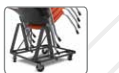
DL1 STACKING DOLLY STACKS 10 CHAIRS (4 LEGS ONLY)