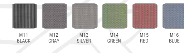
M11 BLACK M12 GRAY M13 SILVER M14 GREEN M15 RED M16 BLUE