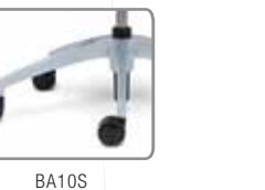
BA10S 26" HIGH PROFILE ALUMINUM BASE SILVER POWDER COAT