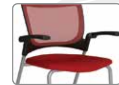
A14 REINFORCED SOFT TOUCH EXTENDED ARM