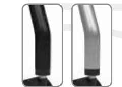
BF BLACK SF SILVER