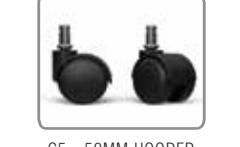
C5 - 50MM HOODED CASTERS C5S - 50MM HOODED HARD FLOOR CASTERS (4 LEG MODELS)