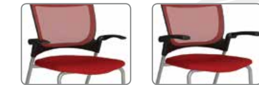
A12 FIXED ARM