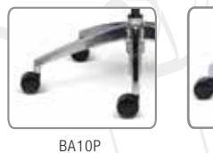
BA10P 26" HIGH PROFILE ALUMINUM BASE POLISHED