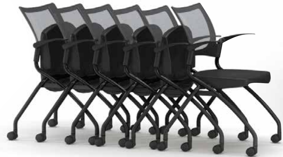
Front Cover: 1360-GT-A12-SF-US-M15-P01; Maharam Messenger Laser-Red Top: 1360-GT-A12-BF-US-M15-P01; 9to5Signature Black Crepe Bottom: 1370-GT-A12-BF-AP-M13-P01-C5

4 leg models stack four high on the floor and ten high on the optional cart. Ganging brackets available.